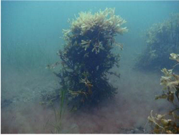
Fucus vesiculosus on coarse sediment. (© K.Fürhaupter, MariLim Aquatic Research GmbH).