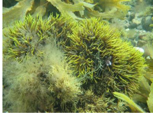
Furcellaria on coarse sediment.