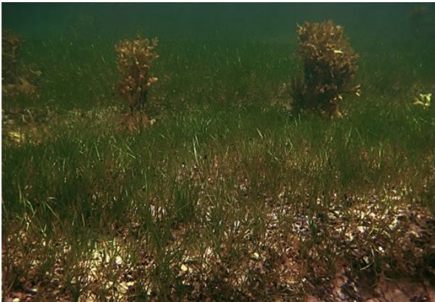
Baltic photic mixed substrate dominated by the common eelgrass, Zostera marina.

Submerged rooted plant communities on Baltic infralittoral mixed substrata (predominantly soft)