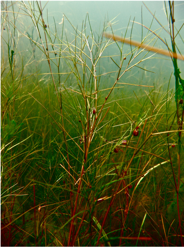
Stuckenia pectinatus in a coastal lagoon near Stralsund, Germany (© K.Fürhaupter, MariLim GmbH).

Submerged rooted plant communities on Baltic infralittoral muddy sediment