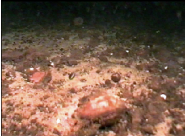
Biotope AB.B1E4 Aphotic hard clay dominated by Astarte spp.

Aphotic hard clay dominated by Astarte spp..