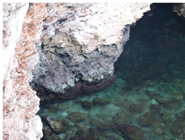
Turf of Corallina officinalis on moderately exposed lower mediolittoral rock in