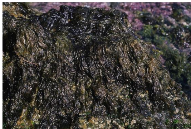
Upper mediolittoral rocks with Pyropia elongata along the Catalan coast, Spain.