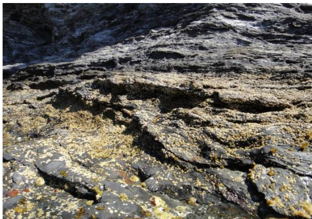
Upper mediolittoral rocks with Chthamalus spp along the Italian coast.

A1.13: Communities of Mediterranean upper mediolittoral rock