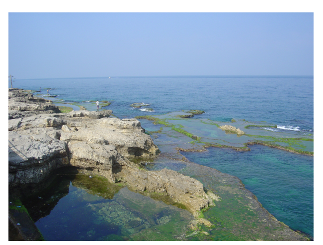
Vermetid reef in Lebanon under the influence of pollution and excesive green algae growth.