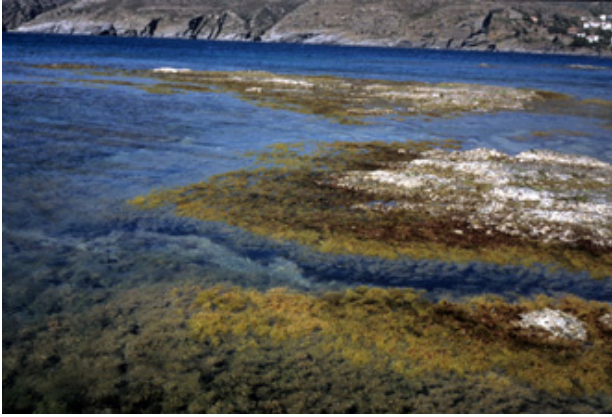
Shallow water assemblage with Halopteris scoparia , Formentera, Spain.