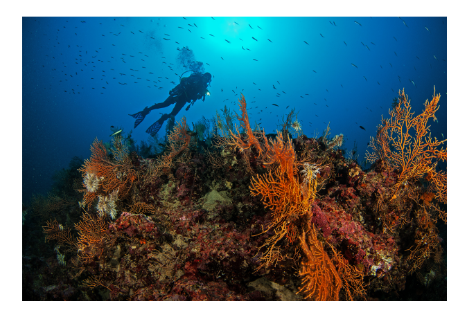
Gorgonian (Eunicella cavolini) at 35m depth, Korinthiakos Gulf, Greece.