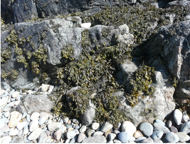
Moderately exposed rocky shore with barnacles, the spiral wrack Fucus spiralis , and the channel wrack Pelvetia canaliculata . Skomer Island, south Wales, UK.