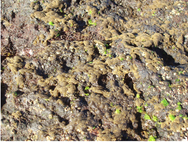
Intertidal rock surface in an area exposed to wave action which has been colonised by tufts of the brown alga Feldmannia mitchelliae . Punta de Galdar, Gran Canaria, Spain.