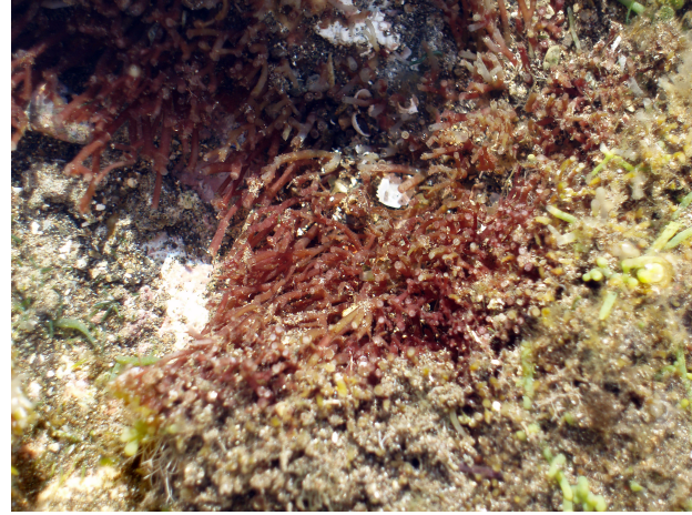
Intertidal rock surface in an area exposed to wave action with Alsidium corallinum the visually dominant species. La Cometa Gran Canaria, Spain.