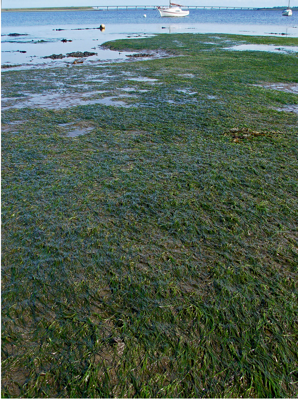
Intertidal seagrass bed, Dornoch Firth, Scotland, UK.