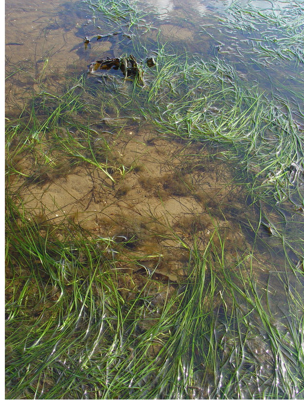
Intertidal seagrass bed, Dornoch Firth, Scotland, UK.