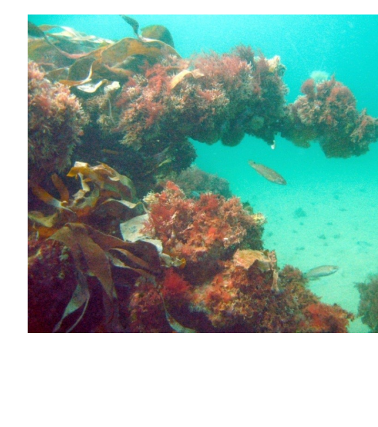
Infralittoral rock habitat with understory of Laminaria hyperborea kelp forest and red seaweeds.