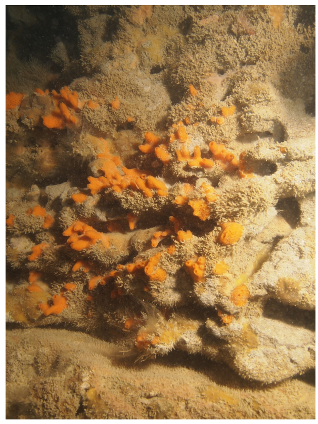
Clay cliff with carrot sponge Amphilecus fucorum and soft hydroid turf. Holes created by the piddock Pholas dactylus are also visible. The Hounds, Sussex UK.