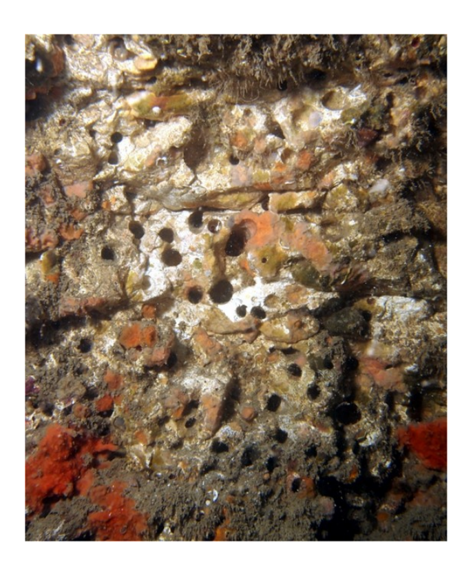
Chalk cliff with holes created by piddock Pholas dactylus . Worthing Lumps, Sussex, UK.