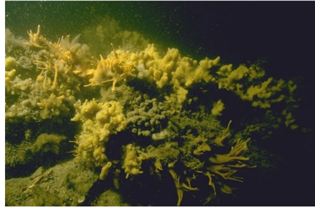
Cushion sponges and hydroids on turbid tide-swept variable salinity sheltered circalittoral rock. Milford Haven, Wales.