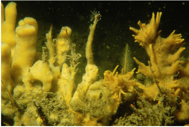
Cushion sponges and hydroids ('Piped' Halichondria , Tubularia indivisa , Amphilectus tucorum ), on turbid tide-swept variable salinity sheltered circalittoral rock, Dockyard Bank, UK.