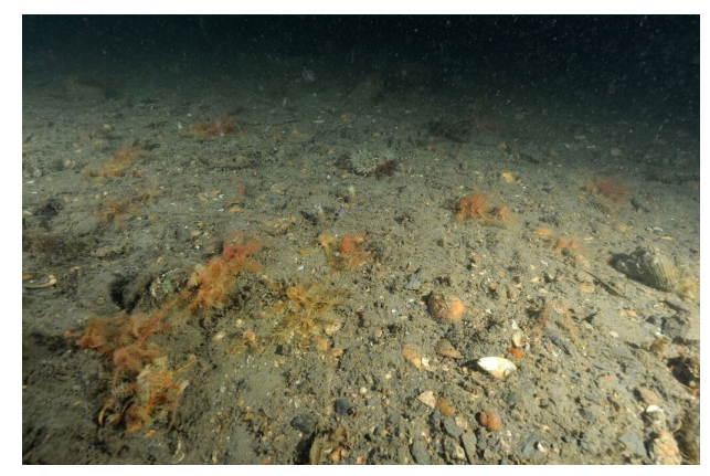
Atlantic lower circalittoral mixed sediment, West Hoe, UK.