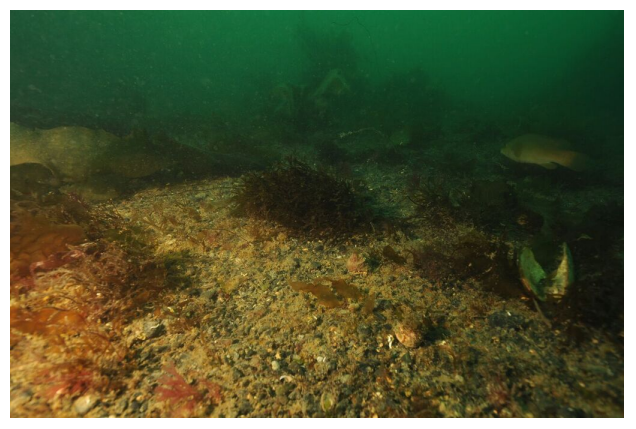
A mix of red and brown algae on infalittoral mixed sediment. Drawna Rocks, UK.