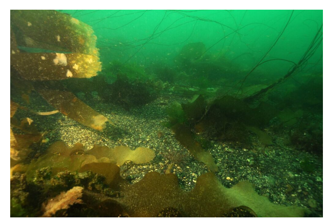
Seaweed communities on mixed sediment with Saccharina latissima and Chorda filum visually dominant. Drawna Rocks. UK.