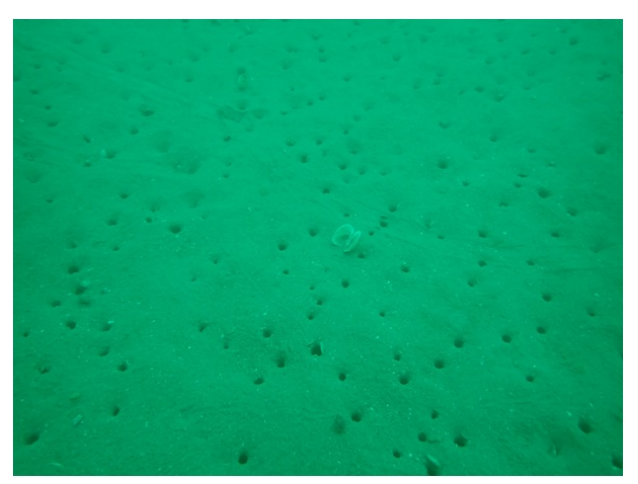
Lower infralittoral thalassinid-dominated muddy sands with Upogebia pusilla at - 15m, Eforie, Romania.