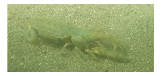
Lower infralittoral sands with Upogebia pusilla out of the burrow, Cape Aurora, Romania.