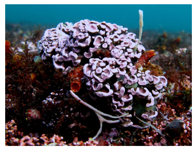
\label{limit} \textit{Lithophyllum} \ sp. \ with \ \textit{Lithothamnion corallioides} \ and \ \textit{Phymatolithon calcareum}. \ Roz \ Bank, \ Bay \ of \ Brest, \ France \ (@A.Pibot).