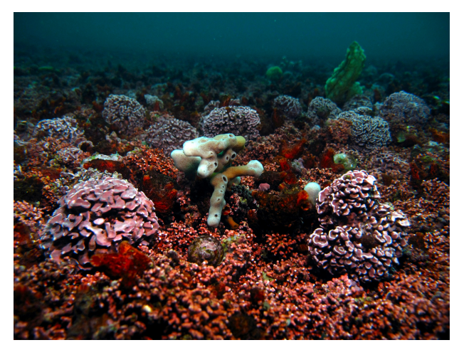
Maerl bed composed of Lithophyllum sp. together with Lithothamnion corallioides and Phymatolithon calcareum. Roz Bank, Bay of Brest, France.