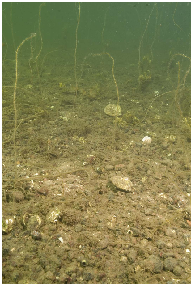
Ostrea edulis beds on shallow muddy mixed sediments, Loch Thurnaig, Scotland (© G.Saunders).