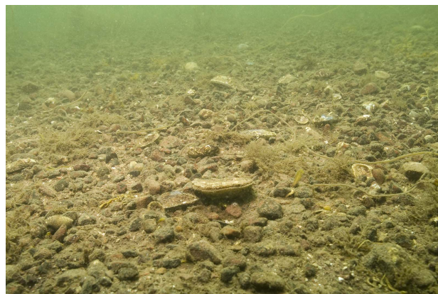
Ostrea edulis beds on shallow muddy mixed sediments, Loch Thurnaig, Scotland.