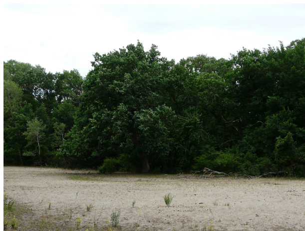
Letea forest in the Danube Delta Biosphere Reserve with Quercus pedunculiflora , Quercus robur , Fraxinus pallisae , Fraxinus angustifolia , Populus alba , Populus tremula and Ulmus minor , growing in long, narrow strips (called "hasmac") between sand dunes with psammophilous vegetation.