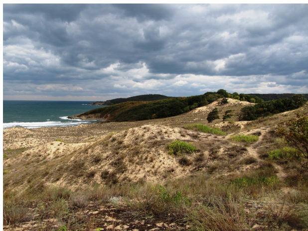
Ropotamo Reserve, southern Black Sea coast in Bulgaria (Photo: Rossen Tzonev).

B1.7b Black Sea broad-leaved coastal dune woodland