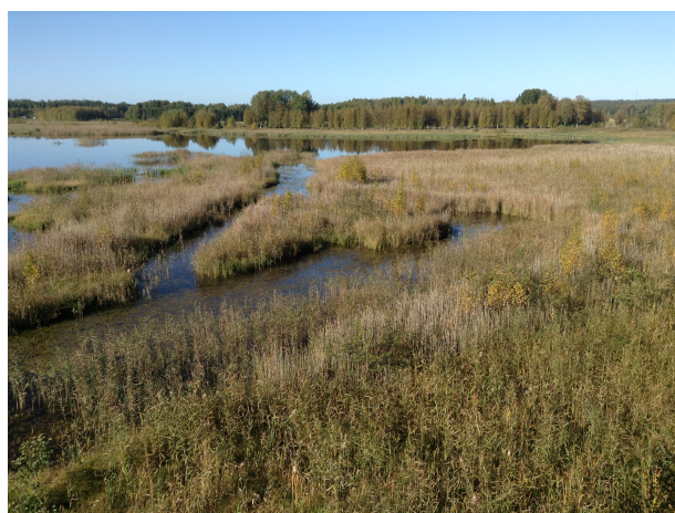
Lake with Characeae in Finland.