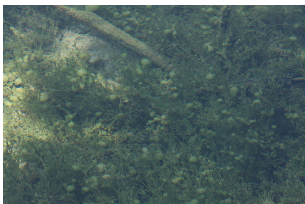
Submerged vegetation dominated by Characeae , Plićvice Lakes, Croatia.

C1.2a Oligotrophic to mesotrophic waterbody with Characeae