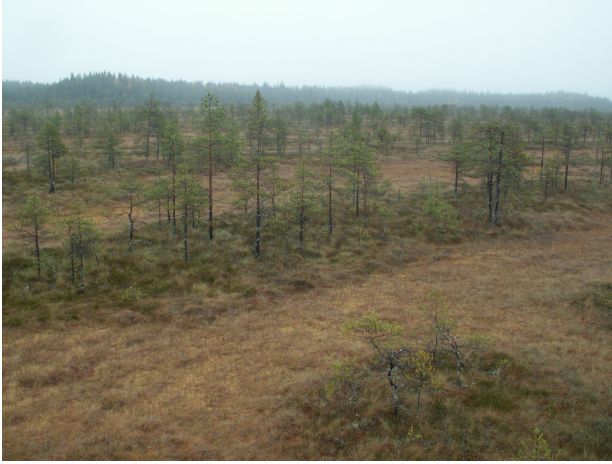
A view over Viirusuo bog in SE Finland, an eccentric (sloping) bog complex where hollows with Sphagnum balticum have an intermediate water level and open water pools are characteristically missing, hummocks strings (kermis) with Sphagnum fuscum and dwarfshrubs, including the eastern Chamaedaphne calyculata . (Photo: Teemu Tahvanainen).