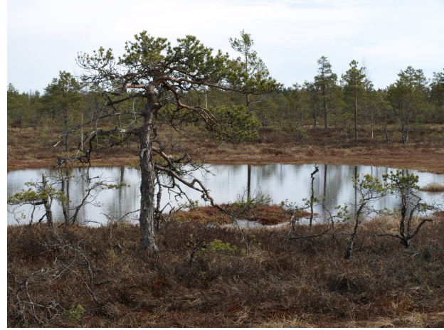
Old cranked pine on a raised bog with abundant Sphagnum magellanicum and a typical secondary bog pool in early spring at Riisu Raba bog, Estonia.