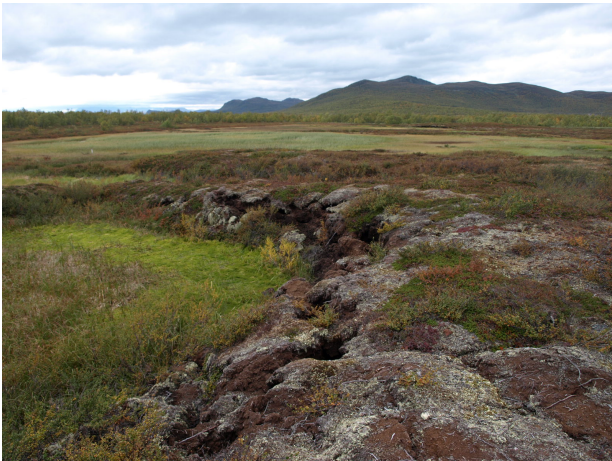
A palsa mound with eroding peat surface and marginal melt of permafrost in northwestern Finnish Lapland at 450 m asl. The whitish colour on the palsa mound surface comes from lichens. Soon after collapse of thawed palsa area, green carpet of Sphagnum riparium has filled the created wet microhabitat. (Photo: Teemu Tahvanainen).