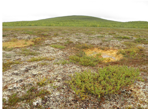
A four hectare wide continuous palsa formation at 440 m asl in northwestern Finnish Lapland. Only small depressions with Sphagnum and Eriophorum vaginatum disrupt the even plateau dominated by lichens and dwarf shrubs like Betula nana and Empetrum nigrum hermaphroditum ..