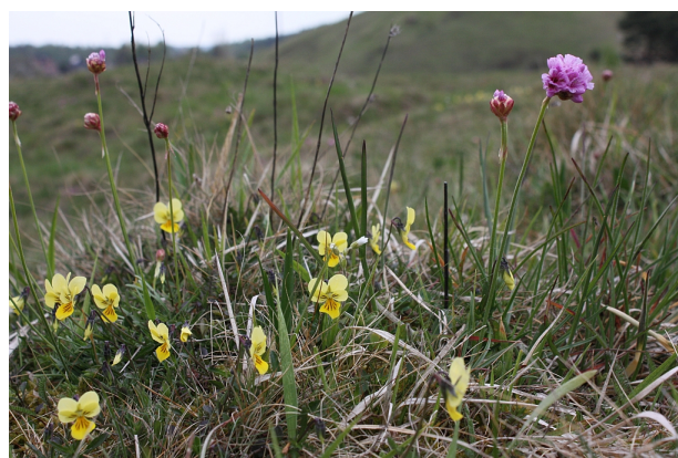
Heavy metal grassland in Breiningerberg, Germany.