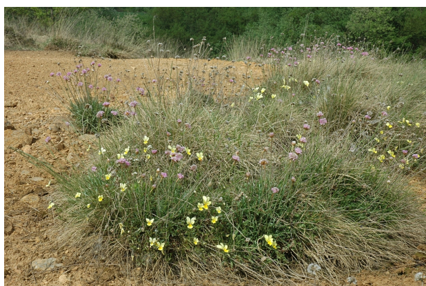
Heavy metal grassland in Theux in Belgium, the type locality of Viola calaminaria (Photo: J.A.M. Janssen).

E1.B Heavy-metal grassland of western and central Europe