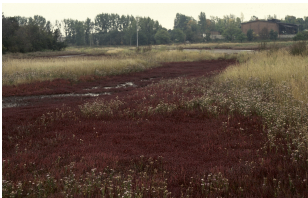
Inland salt marsh in Sülldorf, East Germany (Photo: Carsten Hobohm).