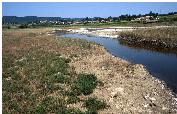
Inland salt marsh with Salicornia europaea near Boian, Romania.