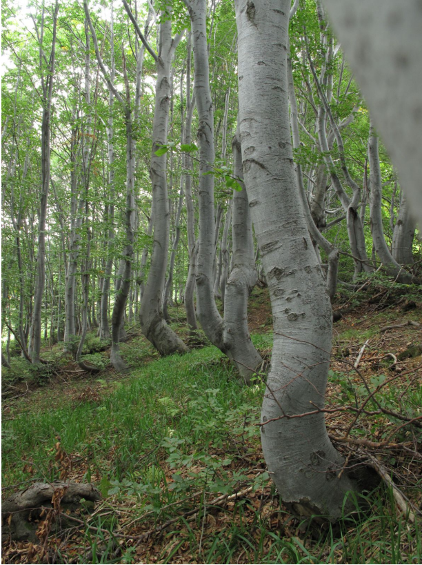
Fagus woodland on acid soils on a steep slope in Vitosha, Bulgaria.