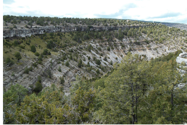
Juniperus thurifera stands belonging to the association Juniperetum hemisphaericothuriferae, Soria area in Central Spain.