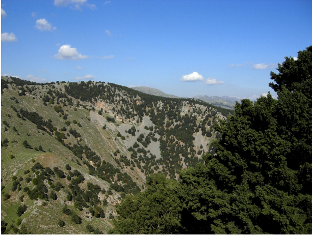
Cupressus sempervirens stands in Lefka Ori, Crete, Greece (Photo: F. Xystrakis).