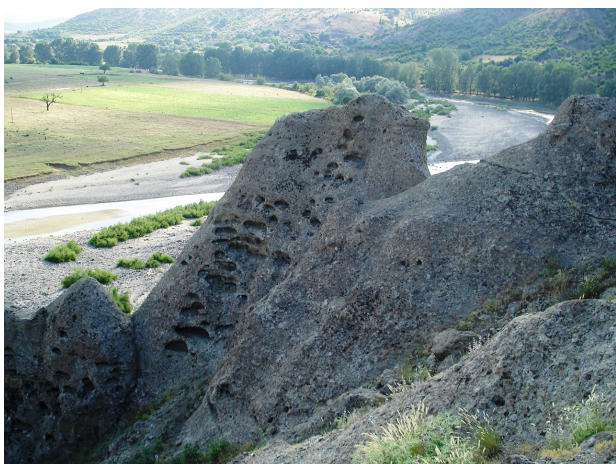
Siliceous inland cliff along the Krumovica River in the Eastern Rodopi mountains of Bulgaria.

H3.1c Temperate, lowland to montane siliceous inland cliff