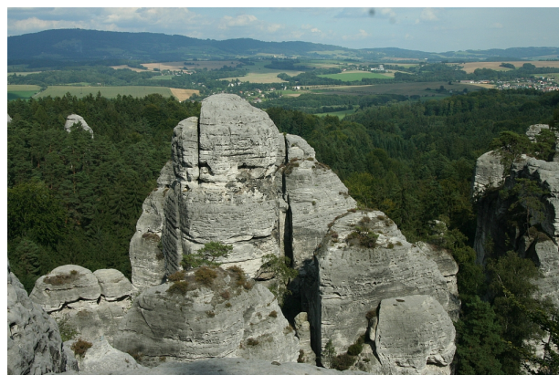
Sandstone cliffs in the Bohemian Paradise of the Czech Republic.