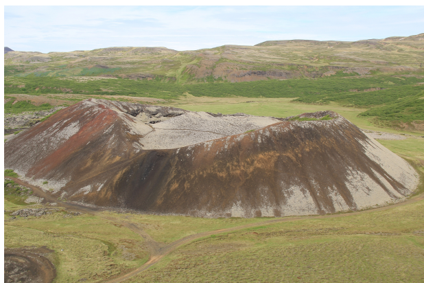
Volcano with sparsely vegetated lava on Iceland. The greyish colour is caused by lichens, especially Stereocaulon species.