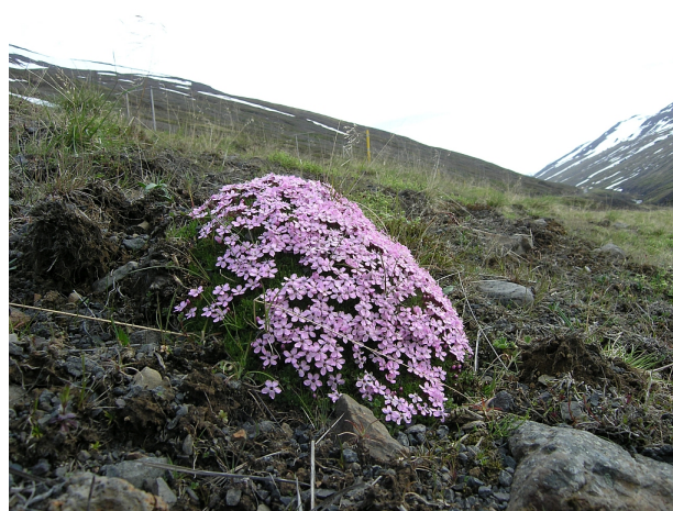
Sparsely vegetated volcanic soils on Iceland with the characteristic Silene acaulis.