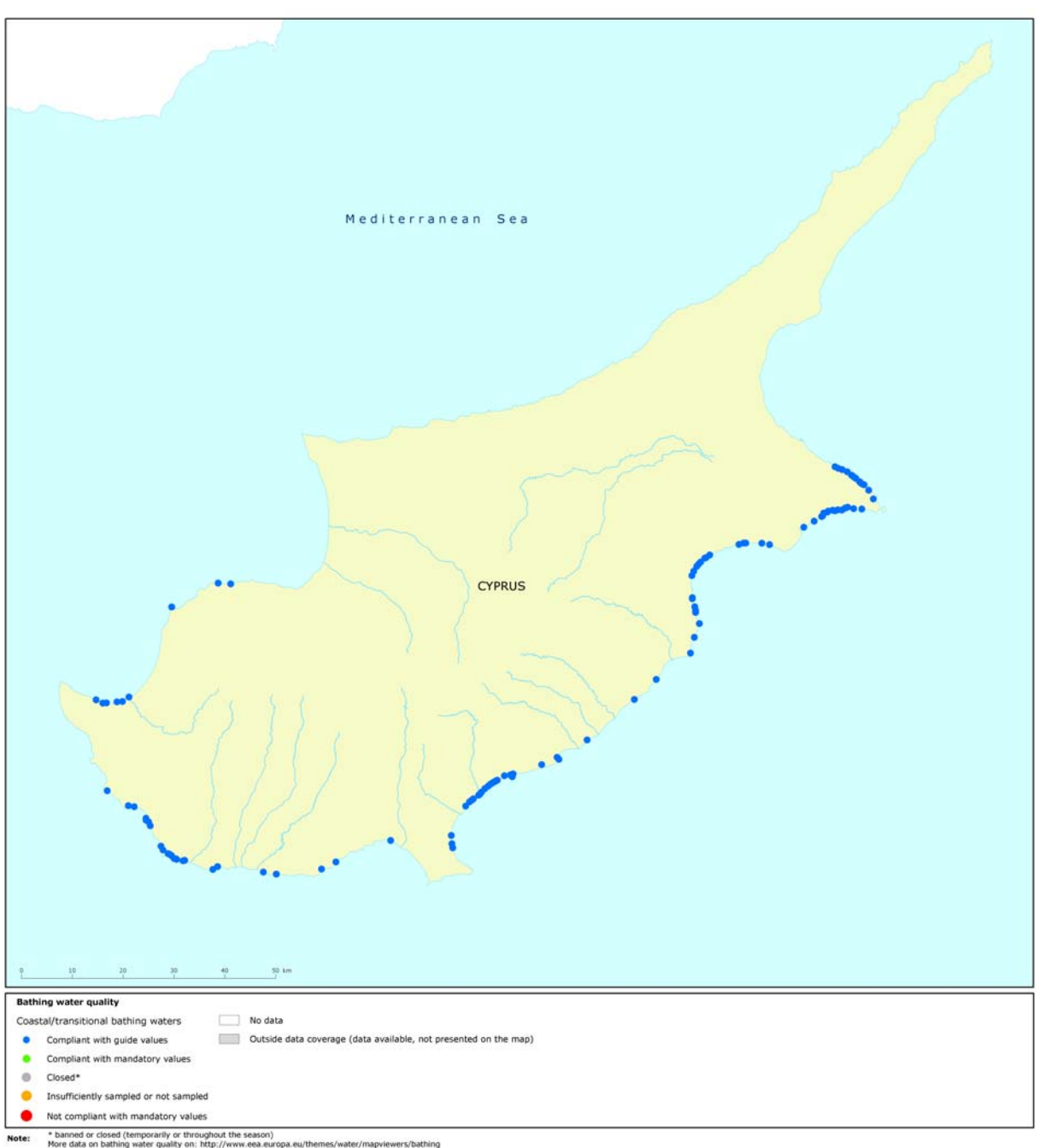
Map 1: Bathing waters reported during the 2010 bathing season in Cyprus

More data on bathing water quality on: http://www.eea.europa.eu/themes/water/mapviewers/bathing